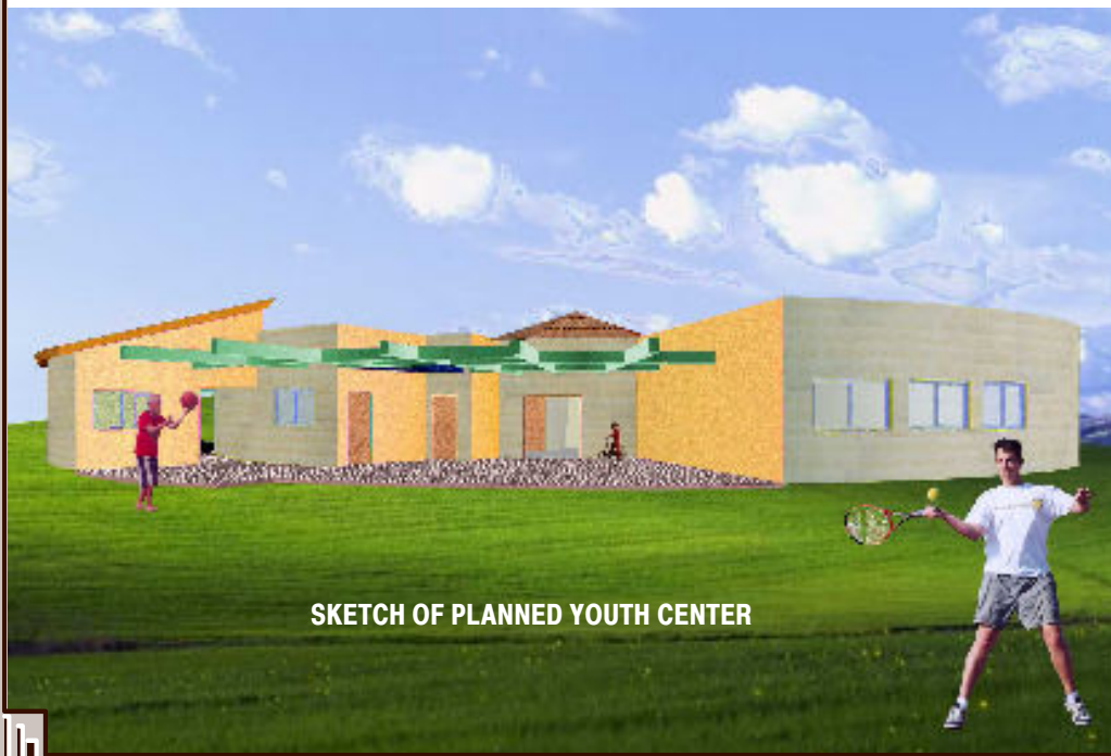
SKETCH OF PLANNED YOUTH CENTER