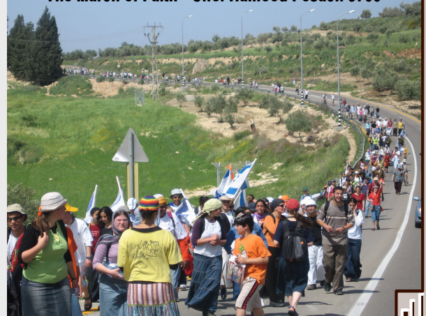
The March of Faith –Chol Hamoed Pesach 5766

In the US: American Friends of Kedumim P.O. Box 55, Union NJ, 07083-0055 Fax: 908-851-2498